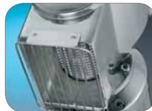
1. Griglia di protezione/rullo inox per GF Protection grate/stainless steel drum for GF