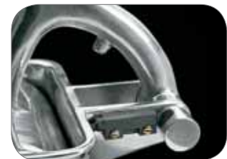
2. Microinterruttore su grattugia Microwitch on the grater