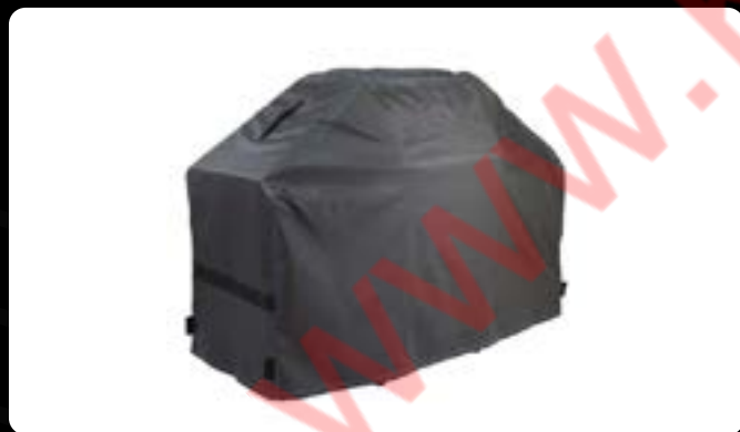
Trolley BBQ Cover TCS4AC-002 - Cover for 4 Burner trolley BBQ Woven polyester.