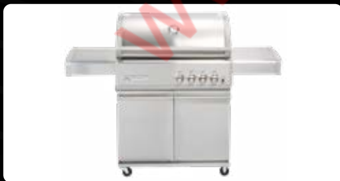
4 burner Trolley BBQ Model TCS4PL

The Range All CROSSRAY BBQ's come with grill plates as standard