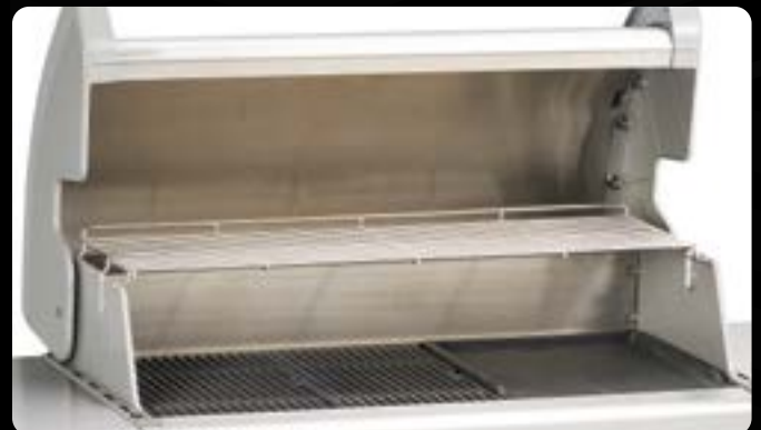
Multipurpose outdoor appliance, lid up or down