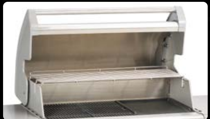
Multipurpose outdoor appliance, lid up or down