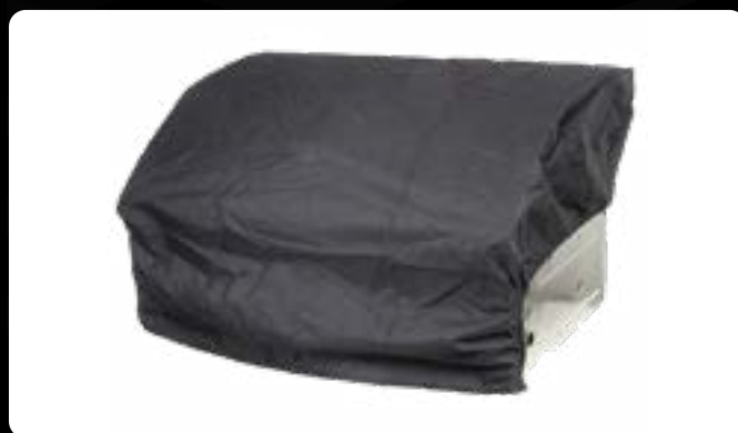
In-Built BBQ Cover TCS4AC-004 - Cover for 4 Burner in-built BBQ Woven polyester.