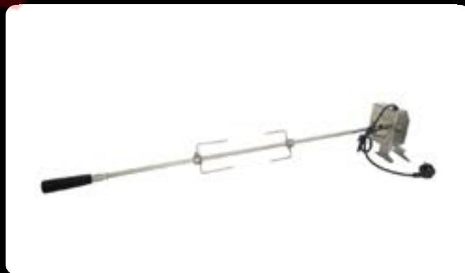
Rotisserie Kit TCS4AC-008 - Rotisserie kit for 4 Burner BBQ.