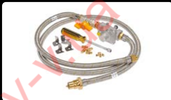
NG Conversion Kit TCS4AC-003 - Natural gas conversion kit - brass jets, Alloy NG regulator.