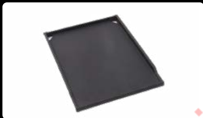
Hotplate TCS4AC-001 - Hotplate (for CROSSRAY Gas BBQ) made from Ceramic coated cast iron.