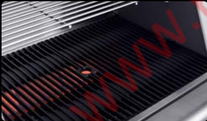
2 piece upper level cooking area