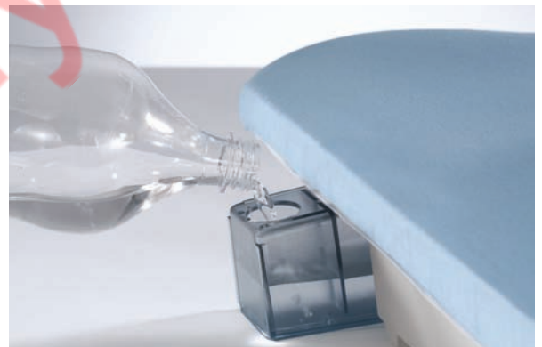
Removable water reservoir