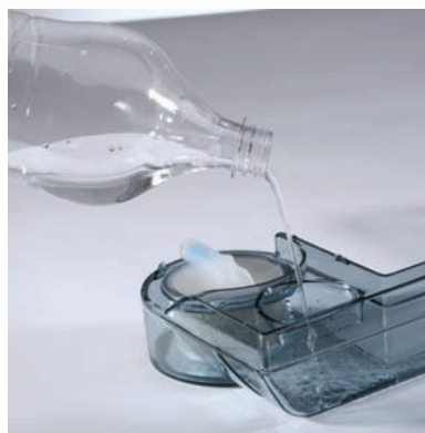
Removable water reservoir