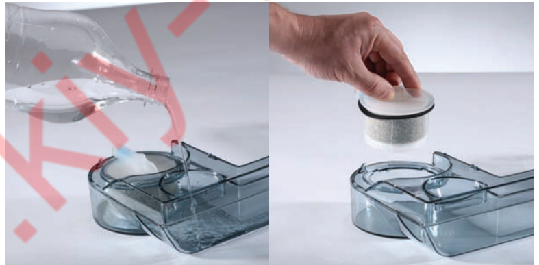
Removable water reservoir