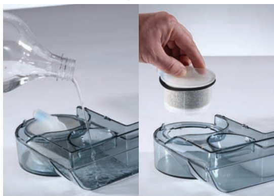
Removable water reservoir